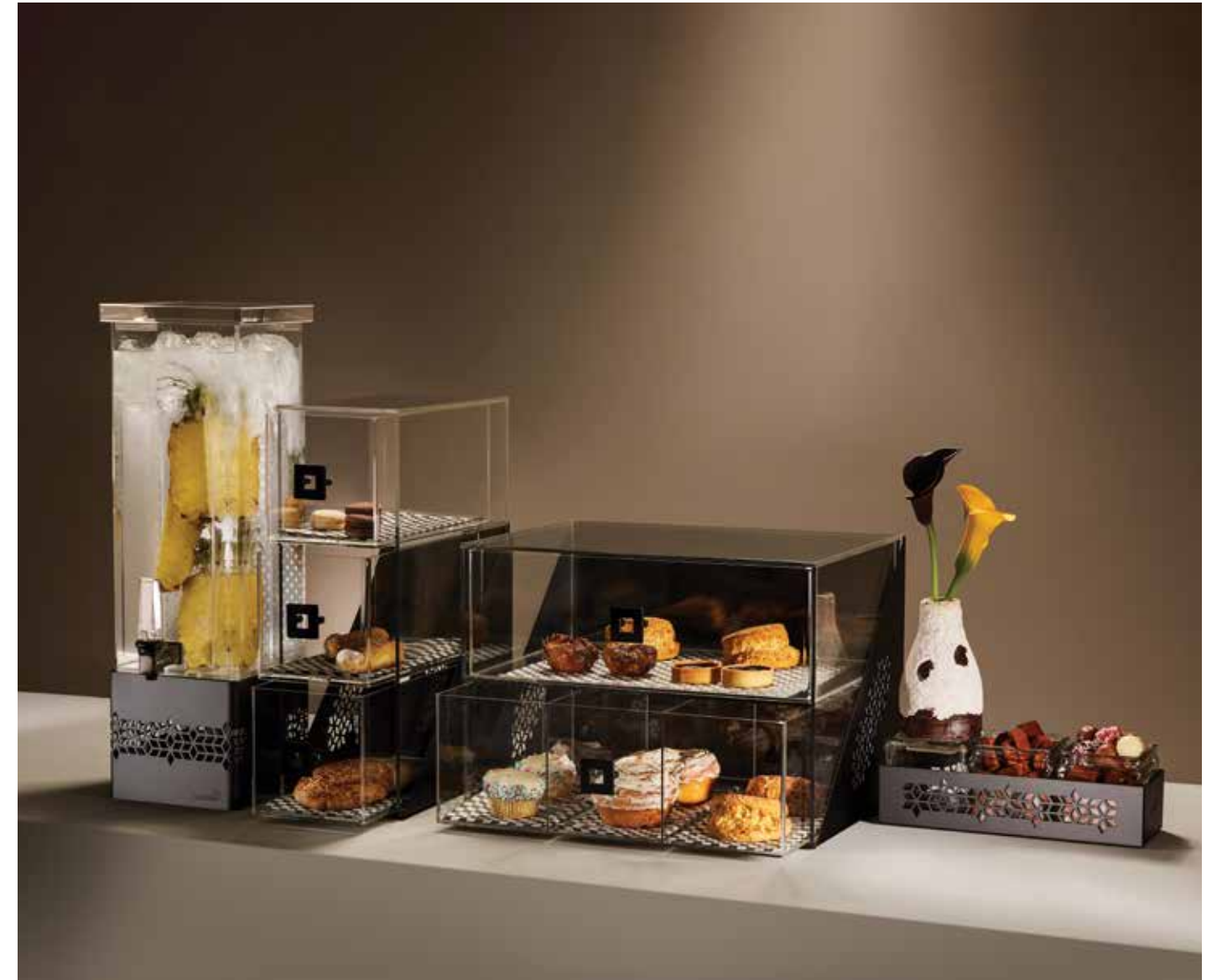
Featured Items (from left to right): #LD169 : 2 Gal. Beverage Dispenser with Black Matte Base / #BD143 : Mosaic Narrow 3 Drawer Black Matte Bakery / #BD144 : Mosaic Wide 2 Drawer Black Matte Bakery / #SM314 : Mosaic 3 Glass Jars with Black Matte Holder