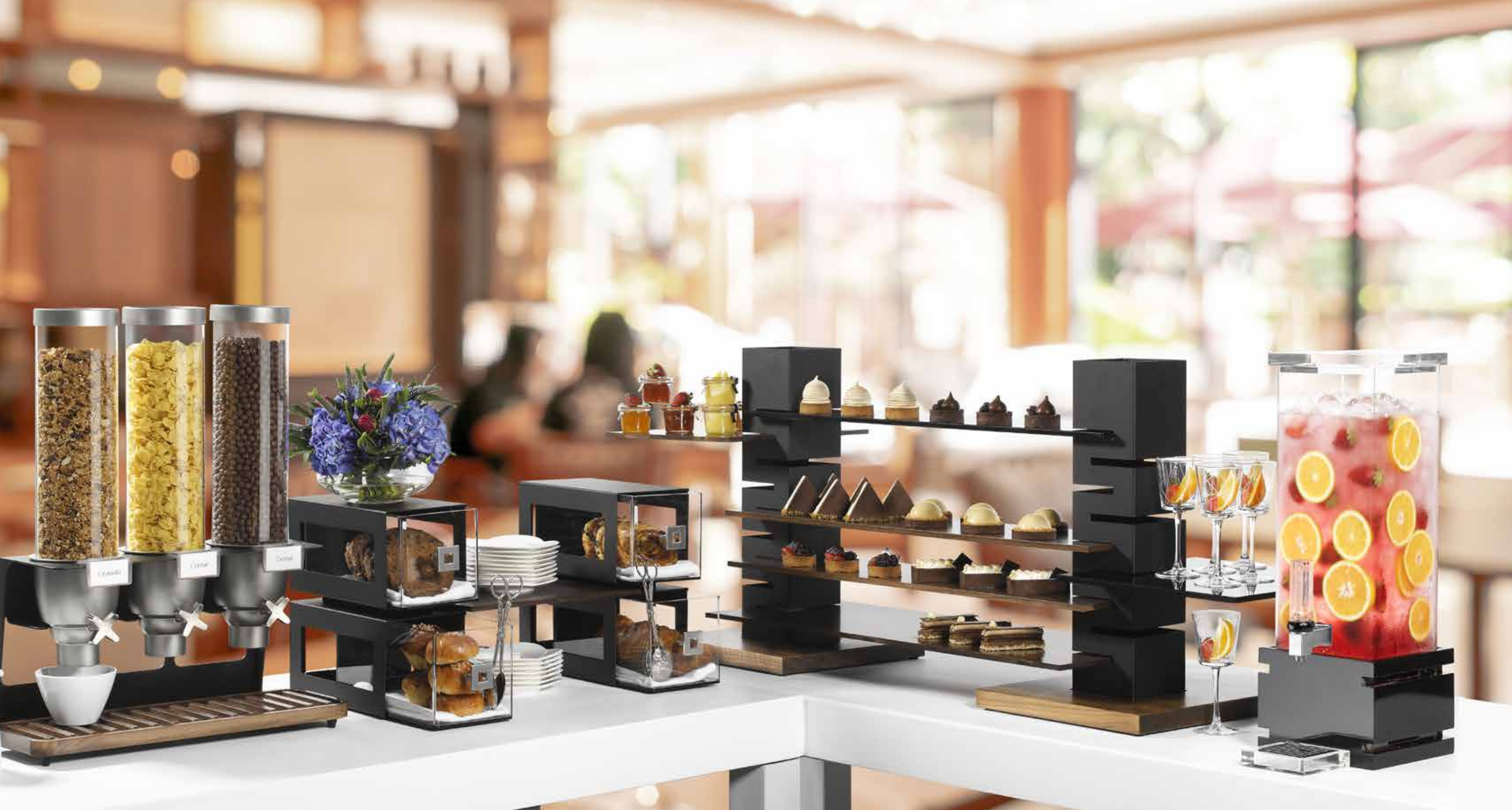
Featured Items (from left to right): EZ-SERV® 1.3 Gal. 3-Container Tabletop Dispenser with Walnut Tray #EZ520, (2) Two-Tier Black Matte Metal Column with Drawers #BD101, 14" Square Walnut Finish Surface #WP301, (2) Tall Black Matte Multi-Level Column Riser with Walnut Finish Base #SM160, (2) Square Black Tempered Glass Surface #SG001, Narrow Rectangle Black Tempered Glass Surface #SG002, (2) Narrow Rectangle Walnut Finish Base #WP201, Wide Rectangle Walnut Finish Base #WP101, Square 2 Gal. Beverage Dispenser with Black Gloss Bamboo Base #LD121, Square Acrylic Drip Tray with Stainless Steel Insert #LD108