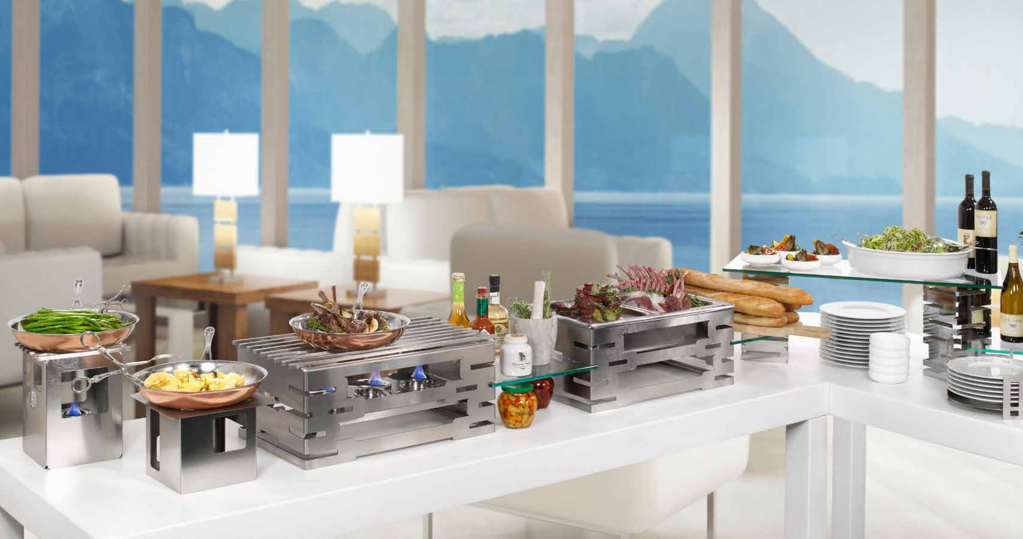
Featured Items (from left to right): Tall Square 10" Stainless Steel Warmer #SM137 , Square Stainless Steel Grill #SM179 , Short Square 7" Stainless Steel Warmer #SM136 , Flat Square Stainless Steel Grill Top #SM139 , Multi-Chef™ 10" Stainless Steel Warmer Kit w/ Grill, 3 Fuel Holders, & Reversible Burner Stand #SK031 , (2) Square Clear Tempered Glass Surface #GTS14 , Multi-Chef™ 10" Stainless Steel Frame #SM343 , MULTI-CHEF™ Rectangular Food Pan, 9L #SMM015 , (2) Skycap® 12" Stainless Steel Multi-Level Riser #D62077 , Wide Rectangle Clear Tempered Glass Surface #GTR33