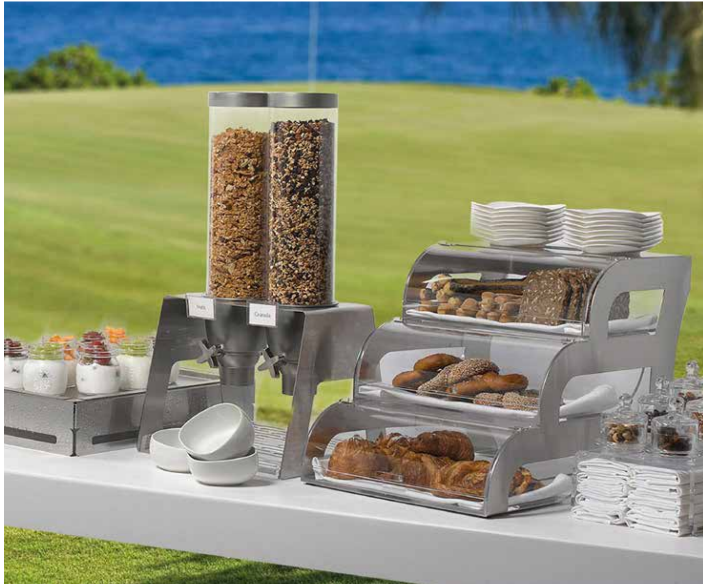
Featured Items (from left to right): Rectangle Stainless Steel Cooler with Stainless Steel Ice Bath, and Texturized Tray #SM144 , EZ-SERV® 1.3 Gal. 2-Container Stainless Steel Tabletop Dispenser with Catch Tray #EZ535 , Three-Tier Bakery Case with Stainless Steel Frame #BK010 , Clear Acrylic Nesting Risers (3 pcs.) #RDC017