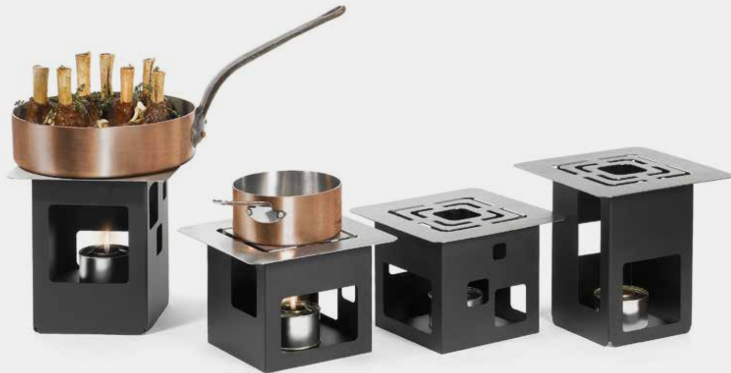
Featured Items (from left to right): (4) Flat Square Stainless Steel Grill Top #SM139, (2) Tall Square 10" Black Matte Warmer #SM141, (2) Short Square 7" Black Matte Warmer #SM140, Fuel Holders - Stainless Steel (3 pcs.) #SM194