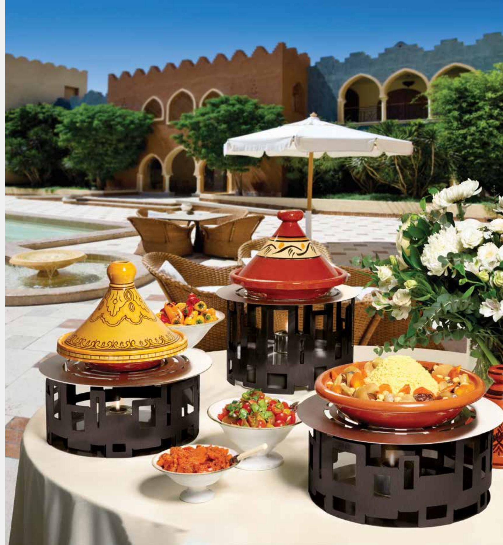
Featured Items (from left to right): (3) Round 16" Stainless Steel Grill Top #SM138, (2) Short Round 7" Black Matte Warmer #SM106, Tall Round 10" Black Matte Warmer #SM111