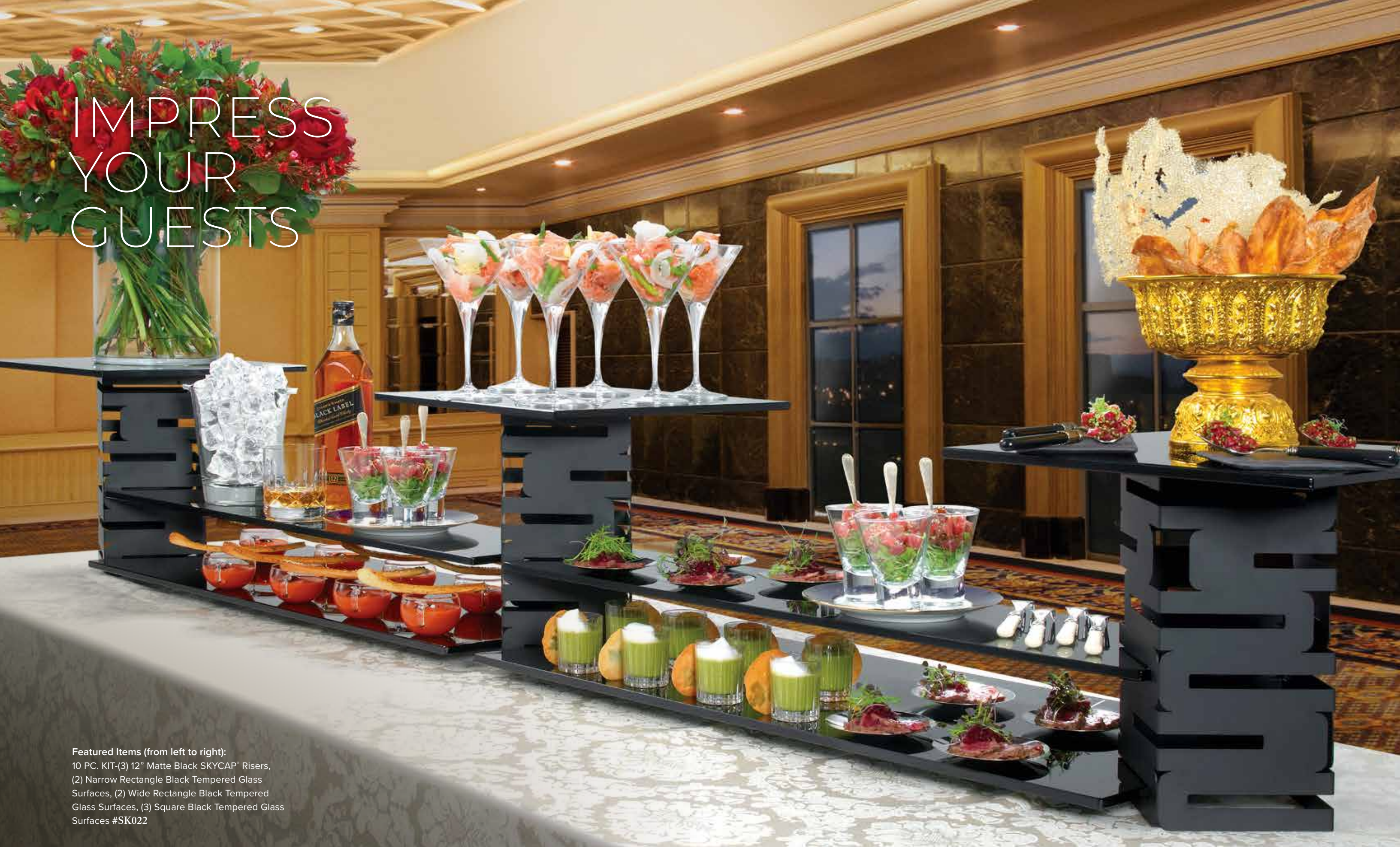
Featured Items (from left to right): 10 PC. KIT-(3) 12" Matte Black SKYCAP® Risers, (2) Narrow Rectangle Black Tempered Glass Surfaces, (2) Wide Rectangle Black Tempered Glass Surfaces, (3) Square Black Tempered Glass Surfaces #SK022