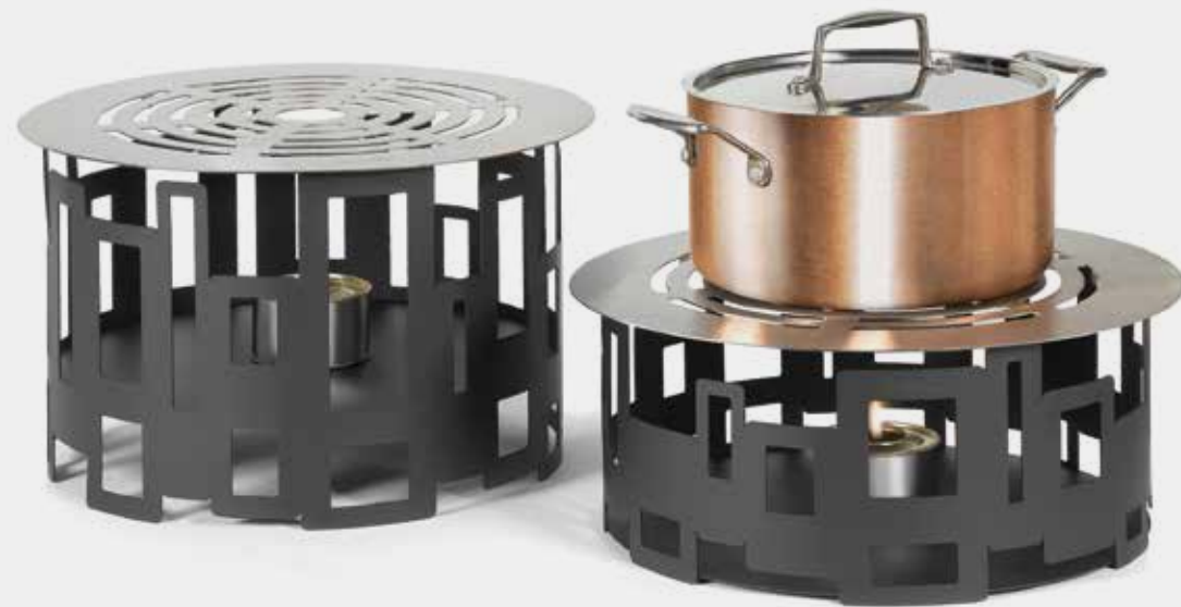
Featured Items (from left to right): (2) Round 16" Stainless Steel Grill Top #SM138, Tall Round 10" Black Matte Warmer #SM111, Short Round 7" Black Matte Warmer #SM106