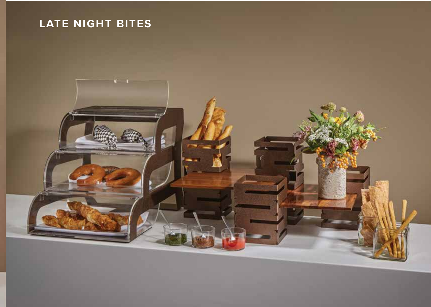
Featured Items (from left to right): Three-Tier Bakery Case with Bronze Frame #BK017, (2) Skycap® 12" Bronze Multi-Level Riser #SM299, (2) Square Walnut Finish Surface #WP301, (2) Skycap® 8" Bronze Multi-Level Riser #SM298, Square Clear Glass Jar, Set of 3 #GLS024