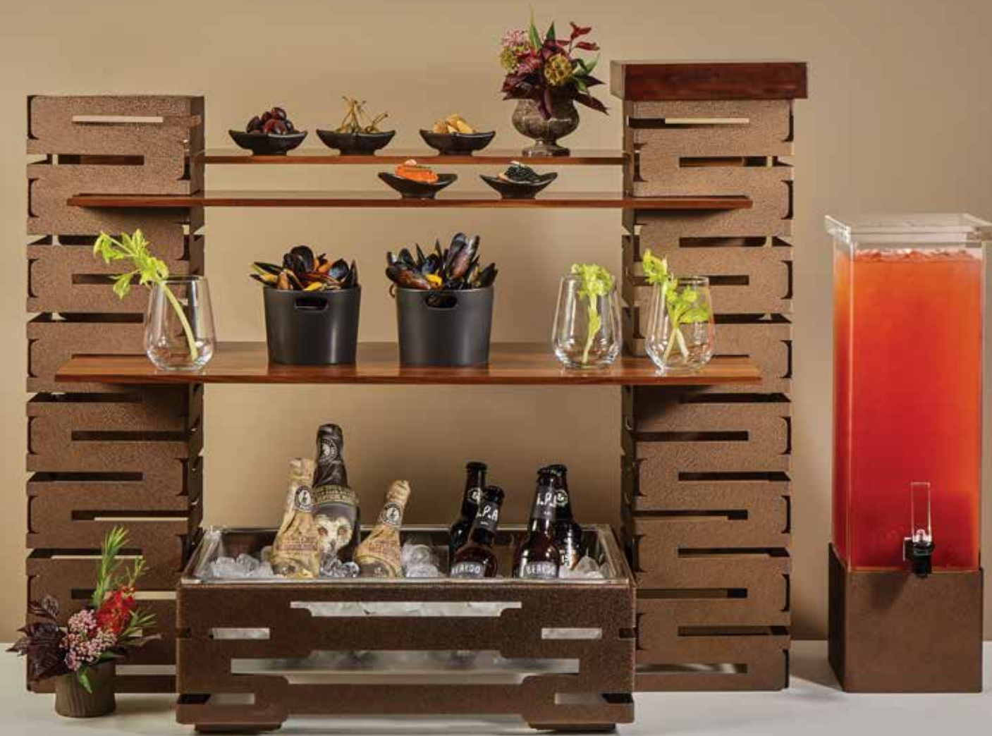
Featured Items (from left to right): (2) Skycap® 30" Bronze Multi-Level Riser #SM325, Rustic Rectangular Black Melamine Mini Dish (Set of 24 pcs.) #MEL005, (2) Narrow Rectangle Walnut Finish Surface #WP201, Rustic Black Melamine Scallop Mini Dish (Set of 12 pcs.) #MEL007, Wide Rectangle Walnut Finish Surface #WP101, Multi-Chef™ 7" Bronze Cooler #SM318, Square Dark Bamboo Base for 18" and 30" Multi-Level Riser #BP012, Square 2 Gal. Beverage Dispenser with Bronze Base #LD173