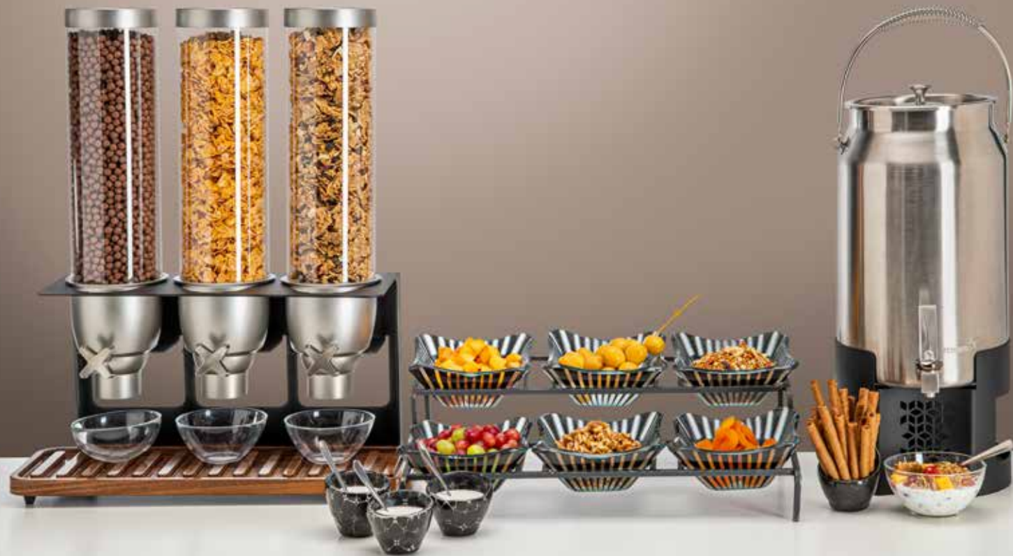
Featured items (from left to right): EZ-SERV® 1.3 Gal. 3-Container Tabletop Dispenser with Bamboo Tray #EZ547, Zenit Black Mini Round Deep Narrow Handmade Glass Bowl, Set of 12 #GLS051B, 2 Level Black Metal Condiment Stand with Six Stelo Black 7" Square Handmade Glass Bowls #GST04BFP, Mosaic 3 Gal. Milk Urn with Black Matte Base #LD204