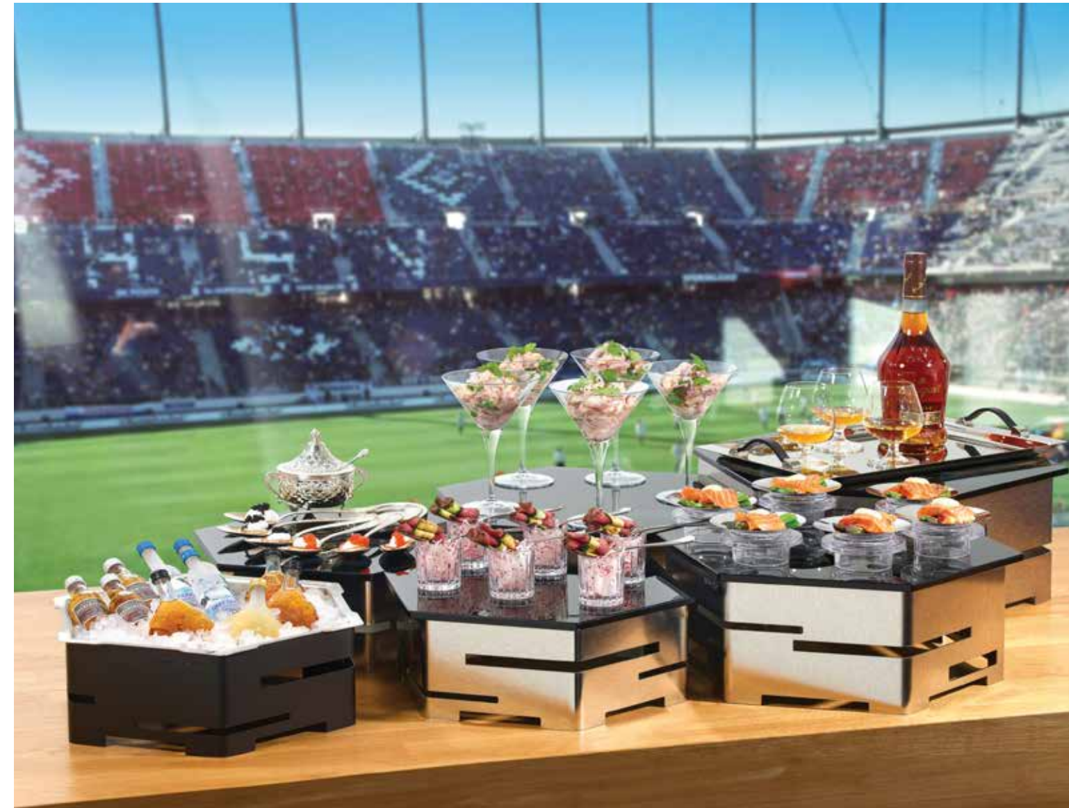
Featured Items (from left to right): (Honeycomb™ Small Black Matte Riser #SM133, Honeycomb™ Small Acrylic Ice Bath #SA100, Honeycomb™ Medium Black Matte Riser #SM134, (2) Honeycomb™ Medium Black Acrylic Surface #SG030, Honeycomb™ Large Black Matte Riser #SM135, (2) Honeycomb™ Large Black Acrylic Surface #SG032, Honeycomb™ Small Stainless Steel Riser #SM116, Honeycomb™ Medium Stainless Steel Riser #SM117, Honeycomb™ Large Stainless Steel Riser #SM118