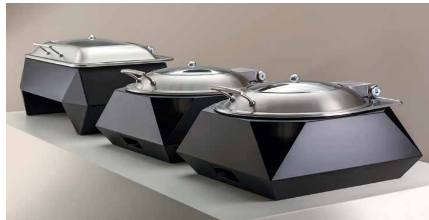
Featured Items (from left to right): Diamond Multi-Chef™ 10" Black Matte Frame #SM273, Multi-Chef™ Rectangular Chafing Pod with Soft Closing Lid and Food Pan #SM249, (2) Diamond Round Black Matte Chafer with Soft Closing Lid #SK050