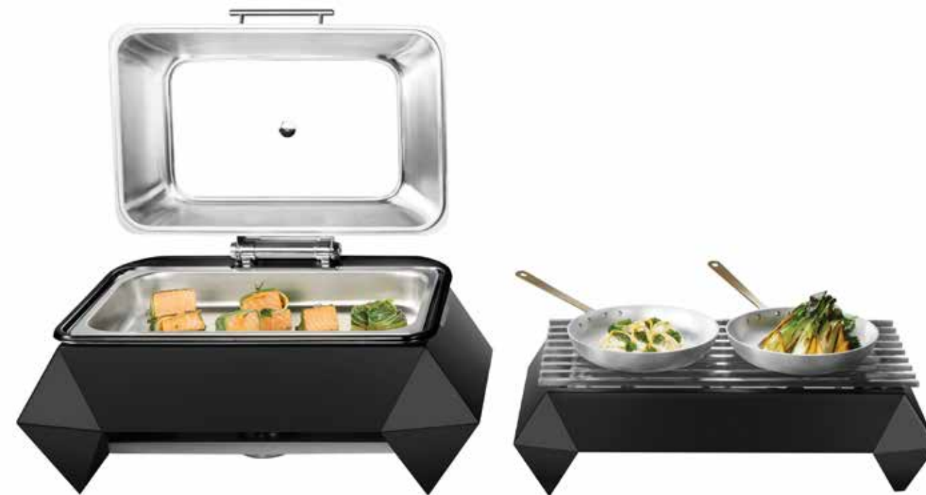
Featured items (from left to right): Multi-Chef™ Rectangular Chafing Pod with Soft Closing Lid and Food Pan #SM249, Diamond Multi-Chef™ 10" Black Matte Frame #SM273, Diamond Multi-Chef™ 7" Black Matte Warmer Kit w/ Grill, 3 Fuel Holders, and Reversible Burner Stand #SK047