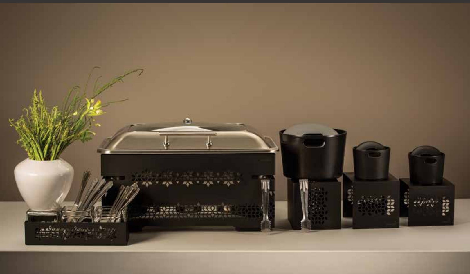
Featured Items (from left to right): Mosaic Black Matte Jar Holder with 3 Glass Jars #SM314, Mosaic Multi-Chef™ 10" Black Matte Warmer w/ 3 Fuel Holders & Reversible Burner Stand #SM321, Multi-Chef™ Rectangular Chafing Pod with Soft Closing Lid and Food Pan #SM249, Mosaic Square Black Matte Nesting Risers (Set of 2 pcs, Small and Large) #SK054