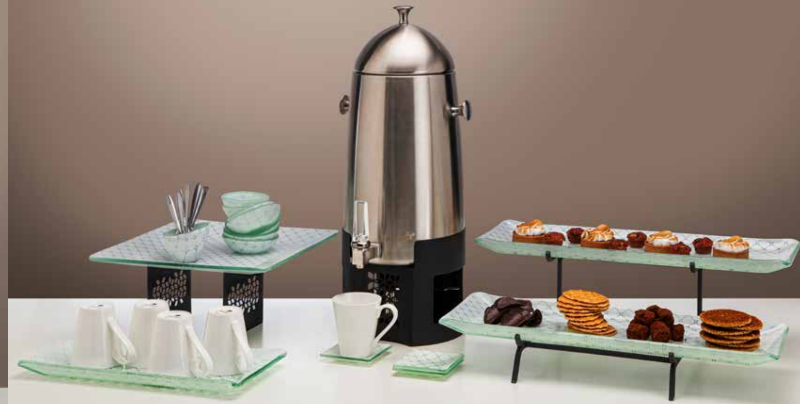
Featured items (from left to right): Zenit White 14" Square Handmade Glass Platter #GLS032W, Zenit White Mini Round Deep Narrow Handmade Glass Bowl, Set of 12 #GLS051W, Zenit White Mini Round Shallow Handmade Glass Bowl, Set of 12 #GLS053W, Mosaic 3 Gal. Coffee Urn with Black Matte Base #LD201, Zenit White Mini Square Handmade Glass Plate, Set of 12 #GLS057W, 2 Level Black Metal Stand with Two Zenit White Large 22.5" Rectangle Handmade Glass Trays #GST02WFP